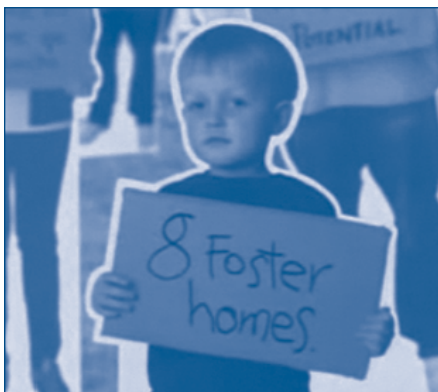
One of the 4,250 life-size cutouts placed in front of the Washington Monument.

For too many Americans, children in foster care are all but forgotten. The National CASA Association intends to change that with the Forgotten Children Campaign. Launched in May, the campaign was created to raise awareness of foster children and to aid in the national recruitment of much needed CASA volunteer advocates.