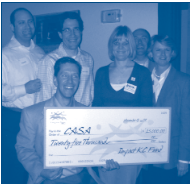
Impact KC members present a check to CASA during a grant awards reception.

In February 2008, CASA of Johnson & Wyandotte Counties and Jackson County CASA together received a $25,000 collaborative grant from Impact KC. The grant's purpose is to implement a metropolitan recruitment and training program to benefit the two CASA agencies. The end result will offer potential CASA volunteers from across the metro greater access to initial, pre-service training sessions.